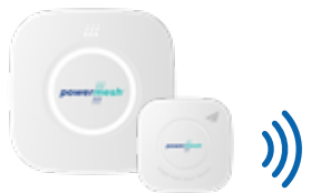
Powermesh Door Controller and Sensor.